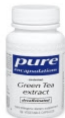
Green Tea Extract (decaffeinated) £24.84